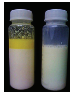
Homogenisation of milk throughout the cycle